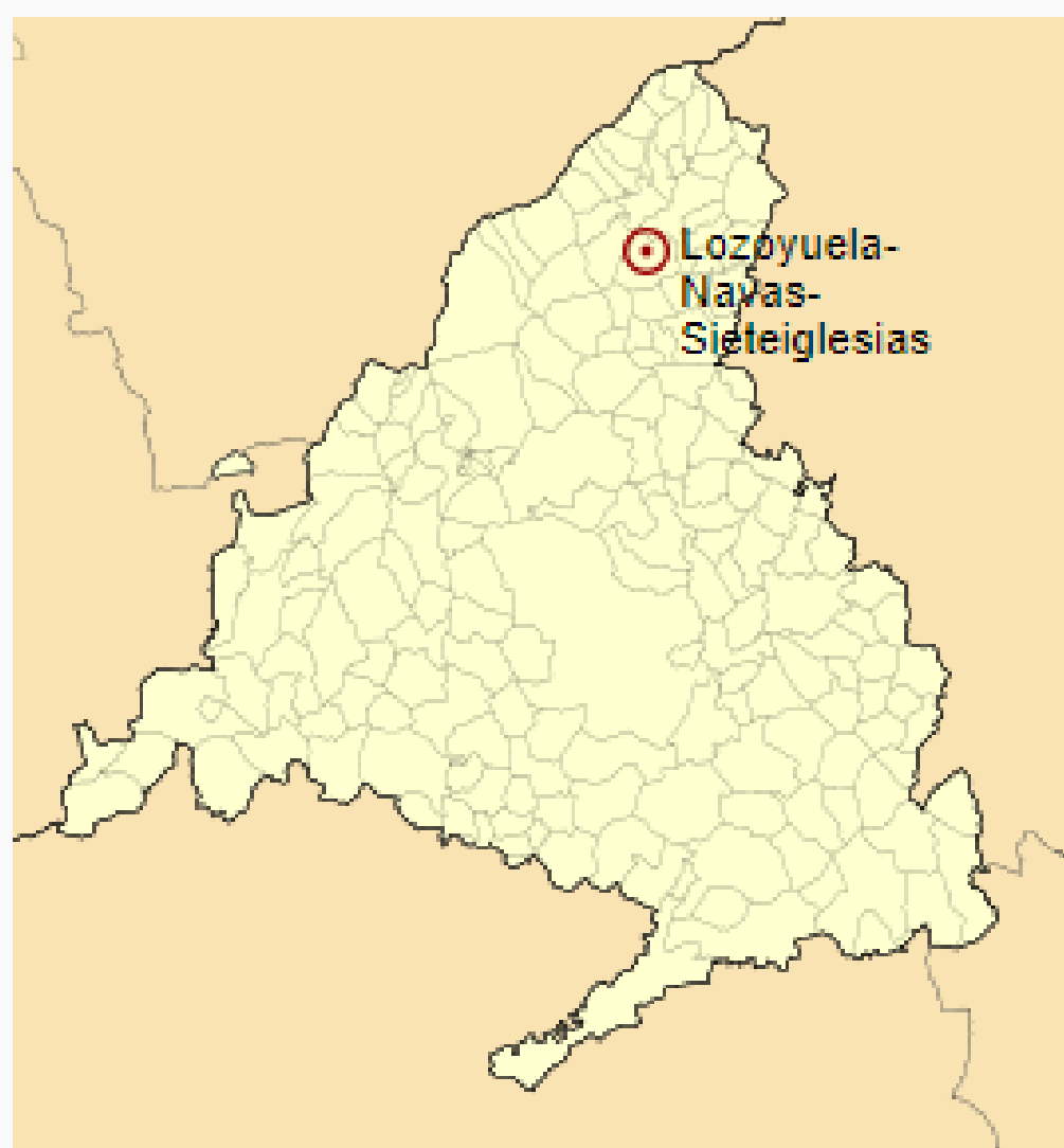
Ubicación de Lozoyuela-Navas-Sieteiglesias en Comunidad de Madrid.