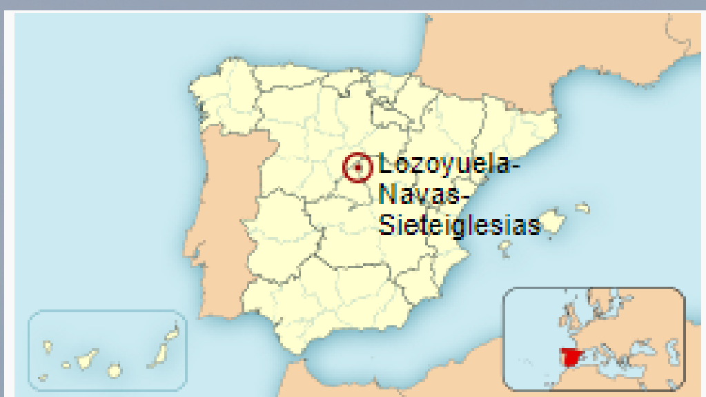
Ubicación de Lozoyuela-Navas-Sieteiglesias en España.

The municipality is made up of the urban centres of Lozoyuela, Navas de Buitrago and Sieteiglesias.